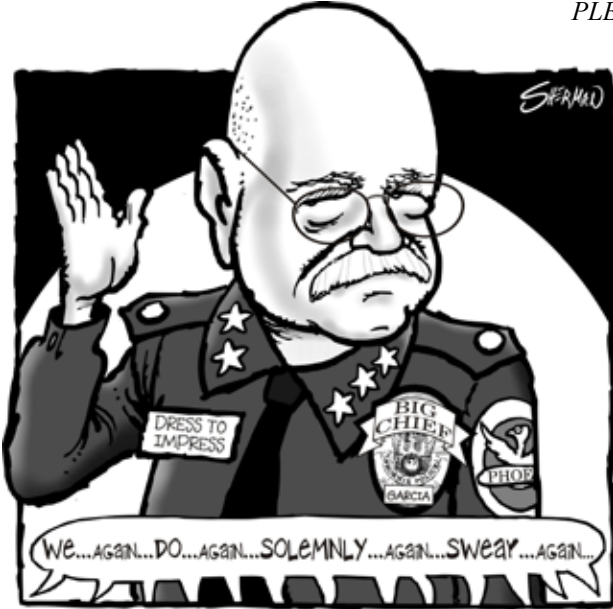
Cartoon reprinted with permission from the artist.